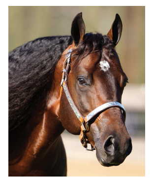
Cromed Out Mercedes