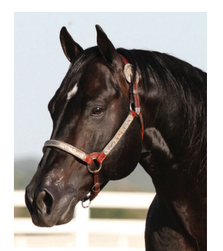
A Sparkling Vintage

Lil Ruf Whiz Quiz: Sired by Lil Ruf Peppy and out of Pretty Ms Qhiz (by Topsail Whiz), Lil Ruf Whiz Quiz has LTE of 16,401. She was the Reserve Champion of the Cinch NRHA Non Pro Futurity's Intermediate