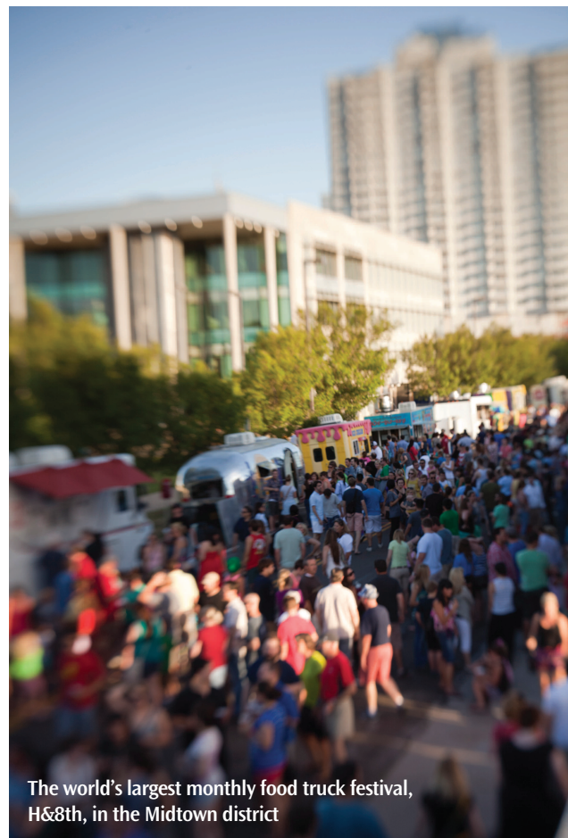
The world's largest monthly food truck festival, H&8th, in the Midtown district