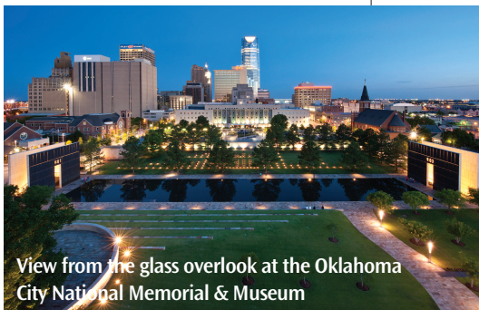
View from the glass overlook at the Oklahoma City National Memorial & Museum