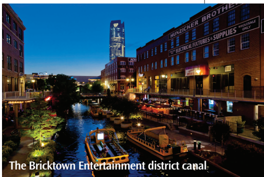
The Bricktown Entertainment district canal

Just minutes from your hotel and State Fair Park, downtown Oklahoma City is home to the Bricktown Entertainment District, which offers several restaurant and entertainment options. There are pubs and live music, as well as attractions such as the American Banjo Museum and Exhibit C, the Chickasaw Nation’s newest art gallery highlighting authentic pieces of artwork hand-crafted by Chickasaw artists. Bricktown also offers the Bricktown Water Taxi, where you can get a fun, narrated tour of the district while floating along the mile-long Bricktown Canal.