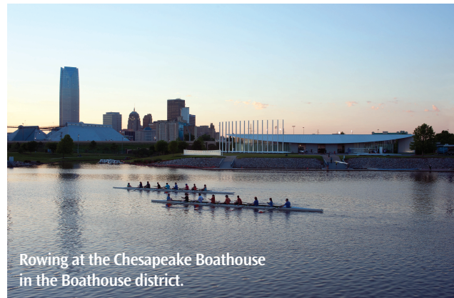
Rowing at the Chesapeake Boathouse in the Boathouse district.